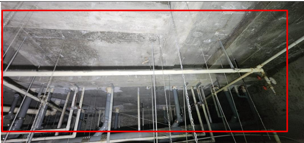
活動室 2 (法團會址) 天花滲水的位置及情況 / The location and condition of the water leakage in Activity Room 2 (Office of IO)